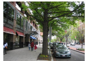
Figure 3: Streetscape should maximize tree canopy.

The Board retains the ability to alter requirements specified under these standards for individual projects. Applicant can request consideration of alternative design solutions to achieve intended goals. Designs must adhere to the Coding and Zoning requirements from the City of Corpus Christi.