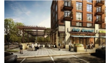
Figure 1: Outdoor Cafe