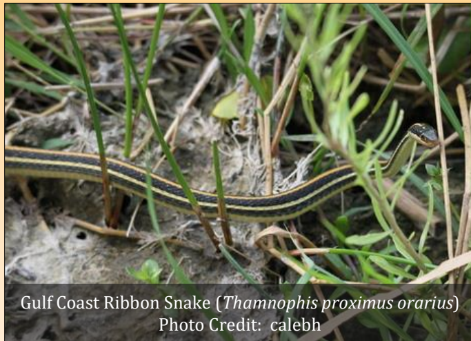
Gulf Coast Ribbon Snake ( Thamnophis proximus orarius )