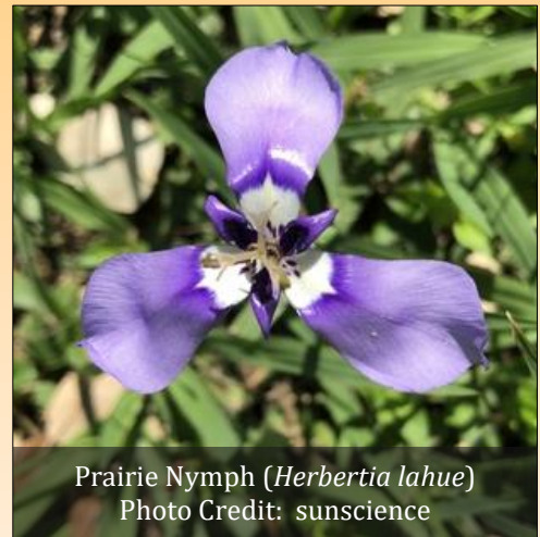
Prairie Nymph ( Herbertia lahue )