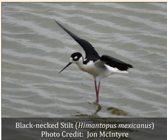
Black-necked Stilt ( Himantopus mexicanus )