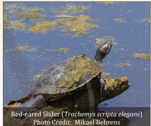
Red-eared Slider ( Trachemys scripta elegans )