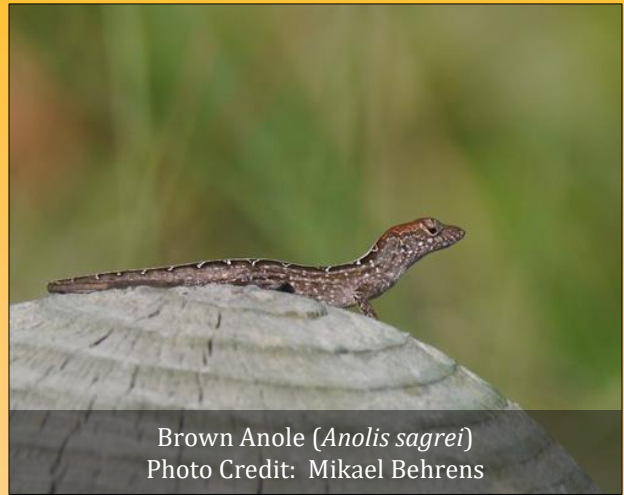
Brown Anole ( Anolis sagrei )